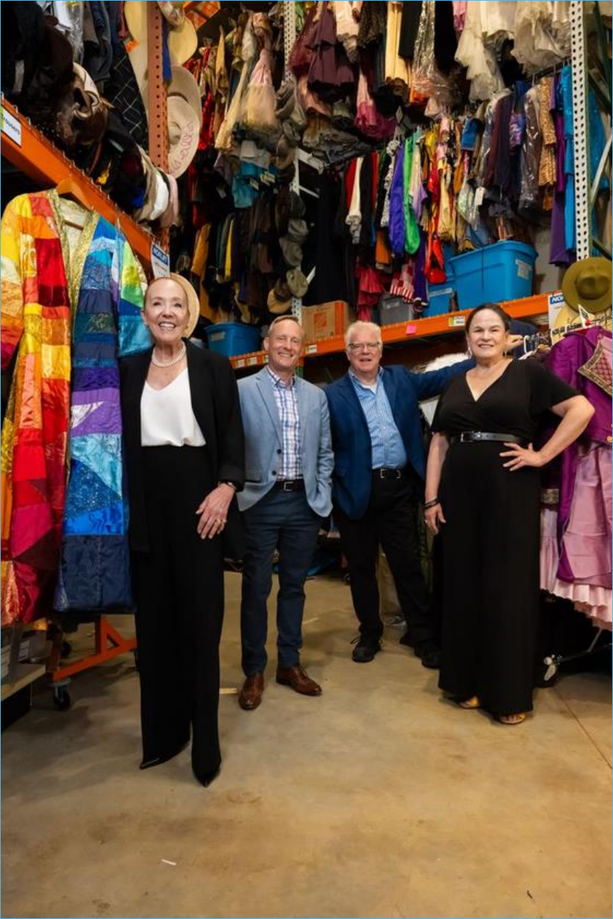
Broadway Rose Theatre

We invest in making long lasting connections because we believe in our communities.