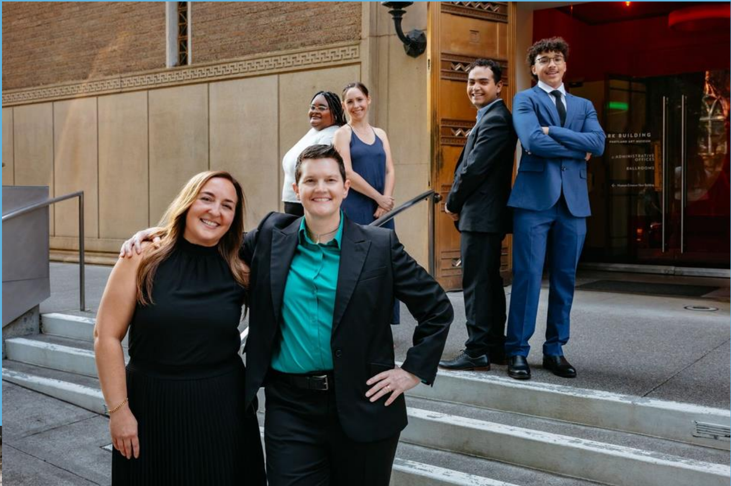
Big Brothers Big Sisters